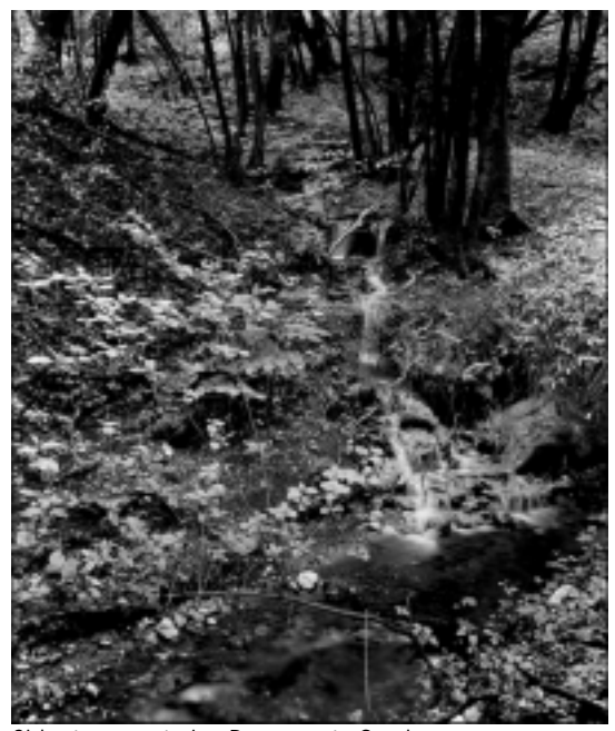
Side stream entering Permanente Creek

all the rainwater falling on the plant is diverted into a large settling pond. Permanente Creek leaves the huge facility with the same sparkle it had high in the hills above the plant.