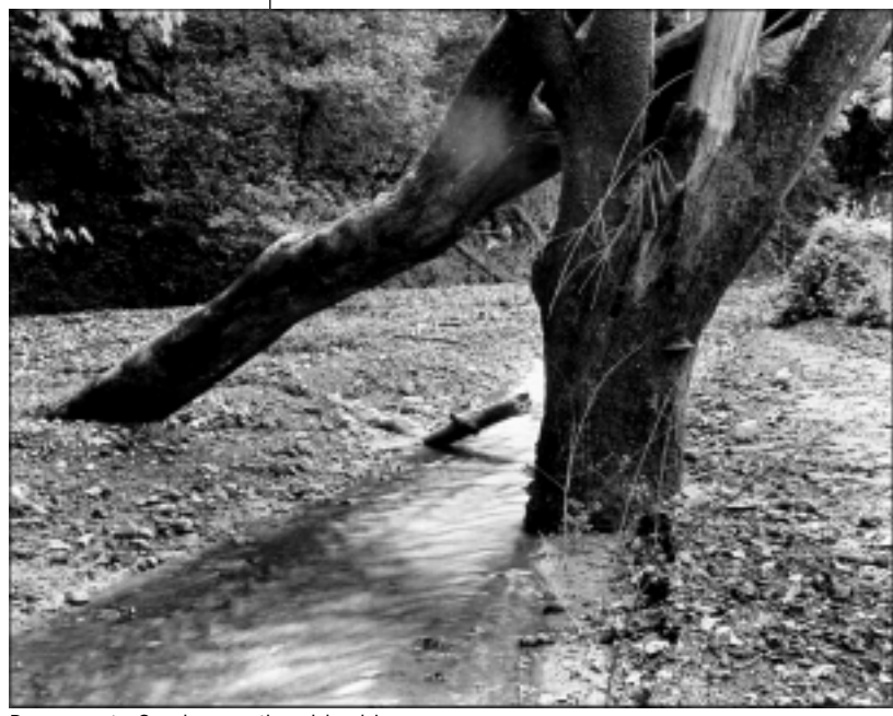
Permanente Creek, near the old cabin

The Spanish named the creek Permanente when they discovered that, unlike others in these hills, it was a dependable source of water; they could count on it to flow during dry seasons, even during dry years. Today, to get to the upper reaches of Permanente Creek, a different river must be crossed—the unending river of immense trucks that rumble through the yards of the Kaiser Cement Company kicking up a haze of gray dust as they carry loads of cement destined for use in construction projects throughout the Bay Area. To protect the creek from contamination of loose cement dust in the air and on the ground,